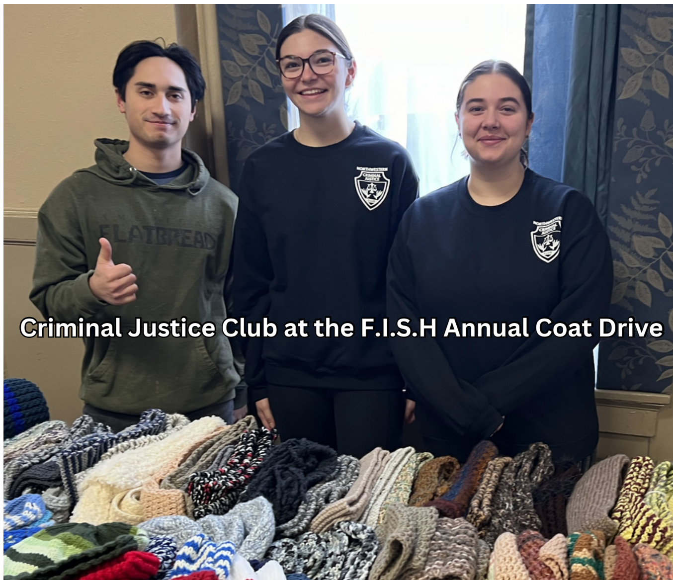
Criminal Justice Club at the F.I.S.H Annual Coat Drive