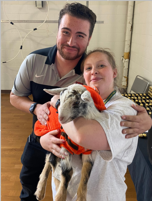
Best Overall Costume